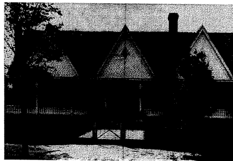
Bennett-Graham-Brewer Home 160 years of Bennett Generations Picture taken 1911